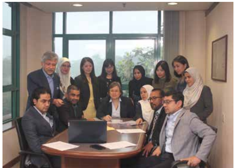
Senior Management Team